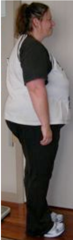
Nov 09 = 127.4kg

I know that people do & I know others say the same things I am about to say but "you can't possibly know how amazing and how wonderful it feels to be the me inside my body now"