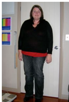
be embarrassed about having a fat mummy.

Length of time post surgery: 12 Months - weight loss of 22 kgs.