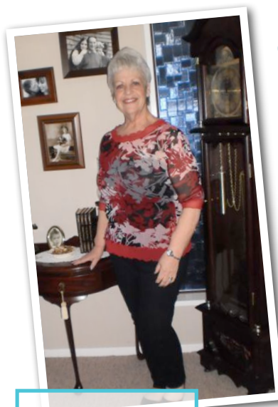
1 year post op

36 Grey Street, Hamilton Ph: 07 859 0185 Fax: 07 859 0187 reception@obesitysurgery.co.nz